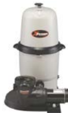
Powerful XStream Pump and Filtration System