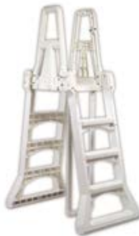
Heavy Duty Pool Bridge Safety Ladder