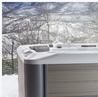
FiberCor® High-Density Insulation