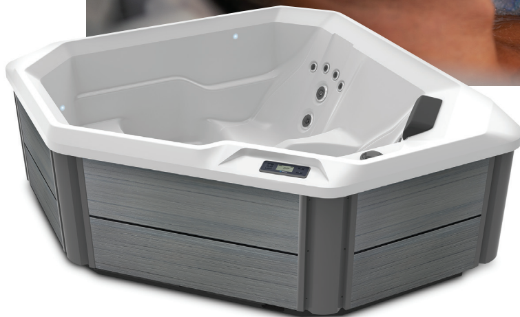
Shown with Alpine White Shell and Storm Cabinet.

People Seating Jets Voltage 2 Seats Open 11 Jets 115 V or 230 V