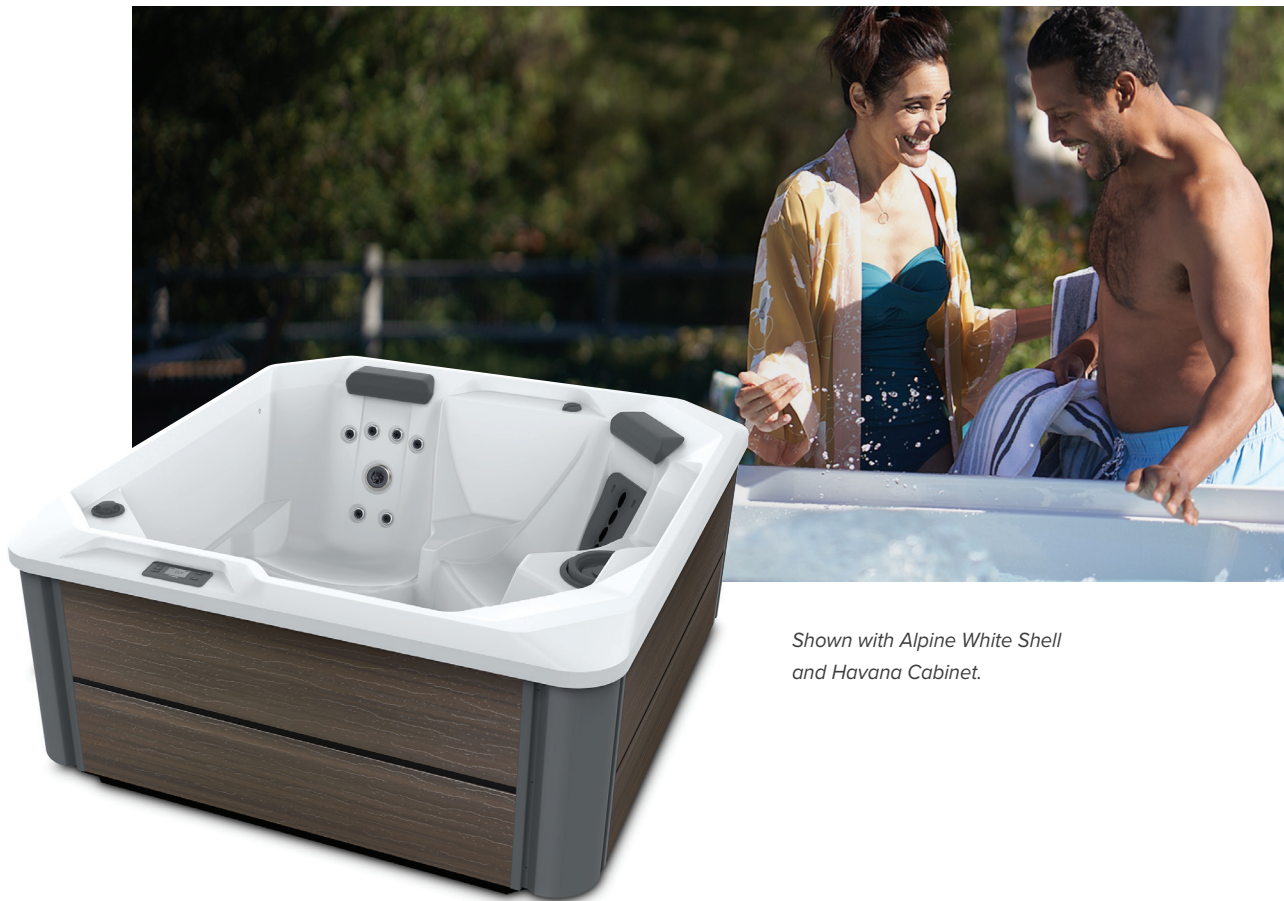
Shown with Alpine White Shell and Havana Cabinet.

People Seating Jets Voltage 3 Seats Open 18 Jets 115 V or 230 V