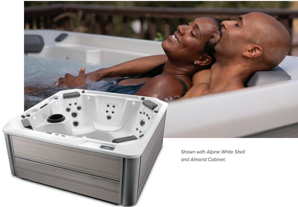
Shown with Alpine White Shell and Almond Cabinet.

People Seating Jets Voltage 7 Seats Open 40 Jets 230 V