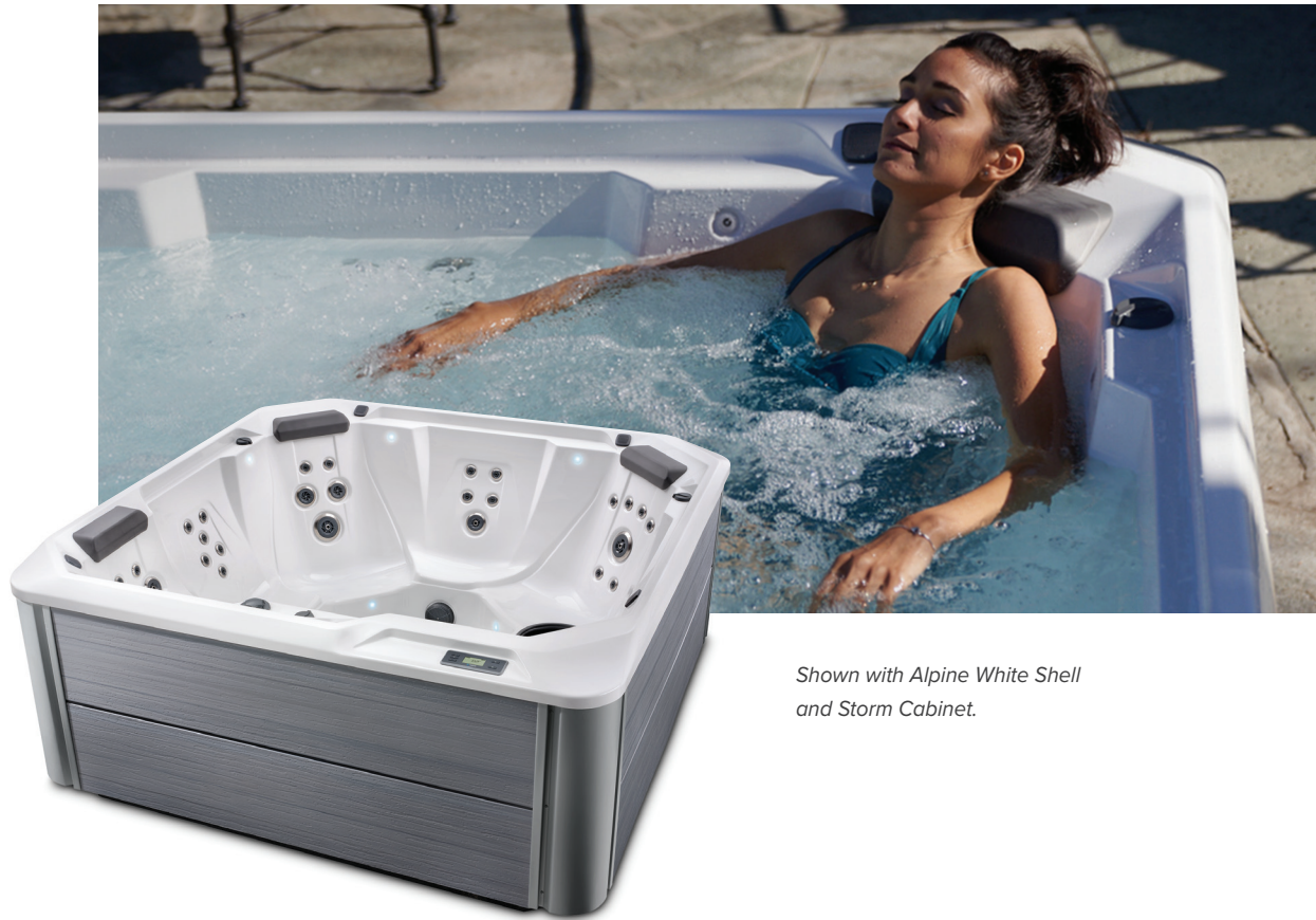
Shown with Alpine White Shell and Storm Cabinet.

People Seating Jets Voltage 6 Seats Lounge 40 Jets 230 V